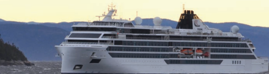
Cruise ships returned at the Bagotville dock in April after a 2 year pause due to the pandemic.