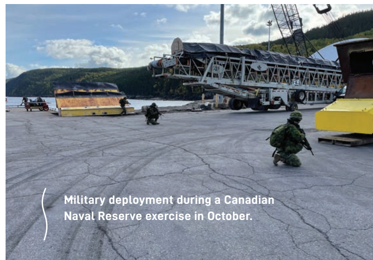
Military deployment during a Canadian Naval Reserve exercise in October.

In line with its commitment to community outreach and corporate citizenship, in October the Port of Saguenay hosted a joint military exercise involving the Canadian Armed Forces and members of several Canadian Forces Naval Reserve divisions in Quebec, including HMCS Champlain in Chicoutimi. The aim of the exercise was to carry out an amphibious operation with land deployment in an urban area, and the Grande-Anse Marine Terminal offered a unique setting for this. This collaboration strengthened ties with the region's large and very present military community.