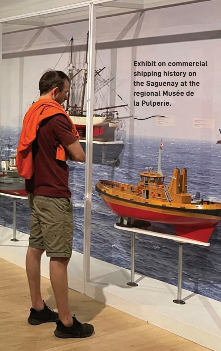
Exhibit on commercial shipping history on the Saguenay at the regional Musée de la Pulperie.