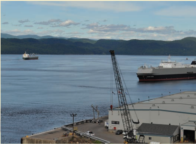
Jaeger Arrow nears Marcel-Dionne dock in July, while the M/V Woody sails away on the horizon.