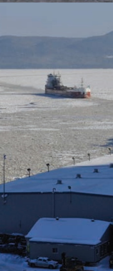
Winter scenery offered by the M/V Iver Brillant, NGCC Louis Saint-Laurent and CSL Baie St-Paul.