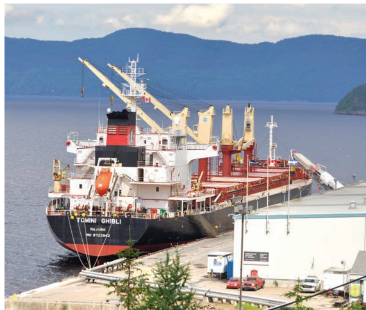
Wood granules shipped to Europe aboard the M/V Tomini Ghibli.

The efficiency and flexibility of the Port of Saguenay's maritime operations team were particularly appreciated as no fewer than six calls were added to the already busy schedule in October, at very short notice, due to tropical storms on the east coast of North America.