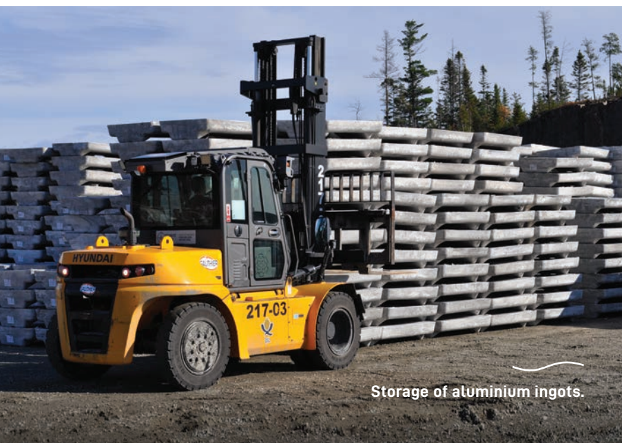
Storage of aluminium ingots.