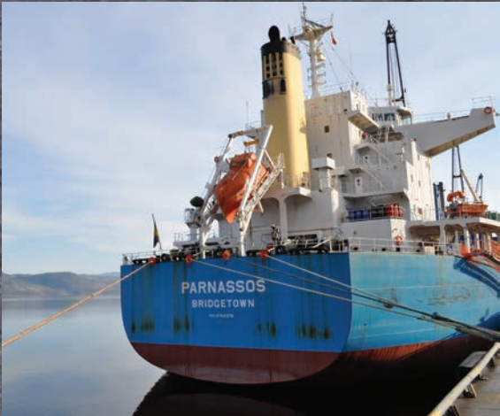
Unloading of M/V Parnassos.