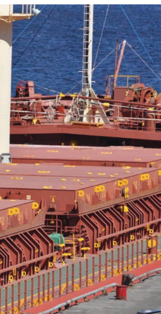
Unloading of anodes.