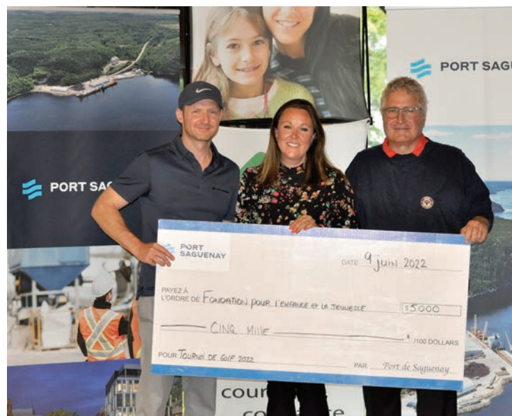
Annual golf tournament benefitting the Foundation for childhood and youth.

The successes and excellent results achieved by the Port of Saguenay can be explained by the close collaboration with its partners and socio-economic development players, as well as within the maritime industry. After a hiatus caused by the COVID-19 pandemic, 2022 saw the return of the annual Port of Saguenay Golf Tournament in June. Despite the rain, the event was a resounding success, raising funds for the Fondation pour l'enfance et la jeunesse du Saguenay-Lac-Saint-Jean . The tournament also served to highlight the contribution of the many partners with whom the Port of Saguenay collaborates and who contribute to the development of the industrial-port zone. In this vein, the team would particularly like to thank the management and employees of QSL Canada and Groupe Somavrac, partners in daily operations, Barette-Chapais, Rio Tinto, Elkem, the Saguenay-Le Fjord Chamber of Commerce and Industry, the City of Saguenay, Promotion Saguenay, the First Nations of Mashteuiatsh, Essipit and Pessamit, the MRC du Fjord-du-Saguenay, the Governments of Quebec and Canada, CMAX, and regional elected officials, to name but a few.